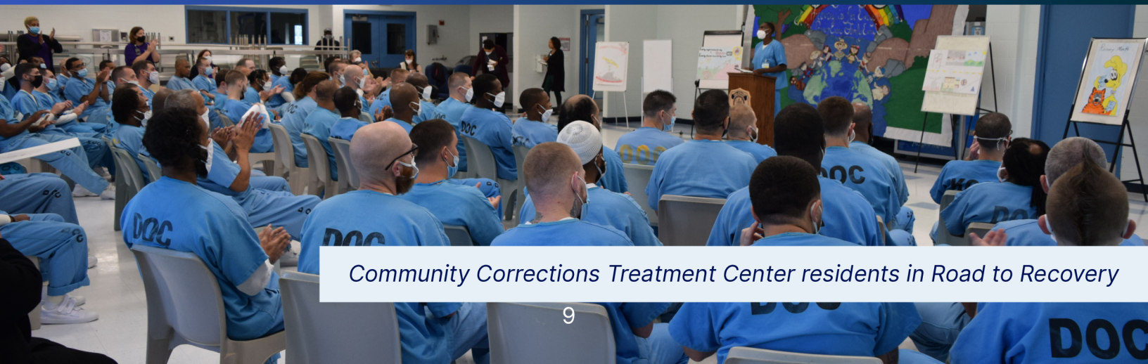
Community Corrections Treatment Center residents in Road to Recovery